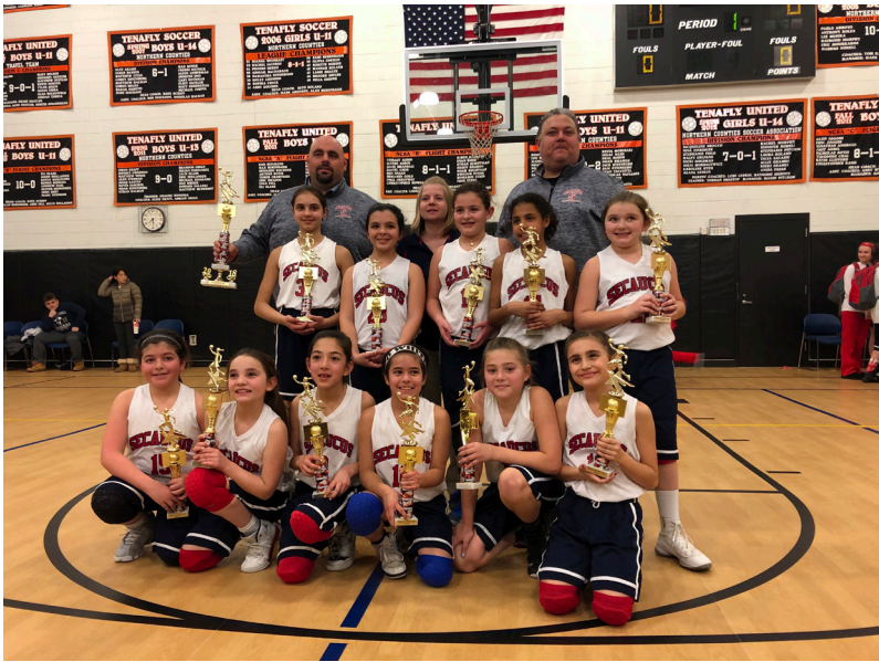
Girls 4th Grade Bergen Travel Basketball League Air Force Division Champions