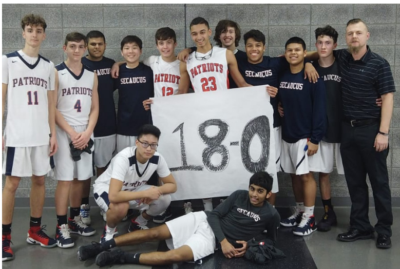
The Secaucus Boys Junior Varsity Boys Basketball team went undefeated this season. Way to go!!