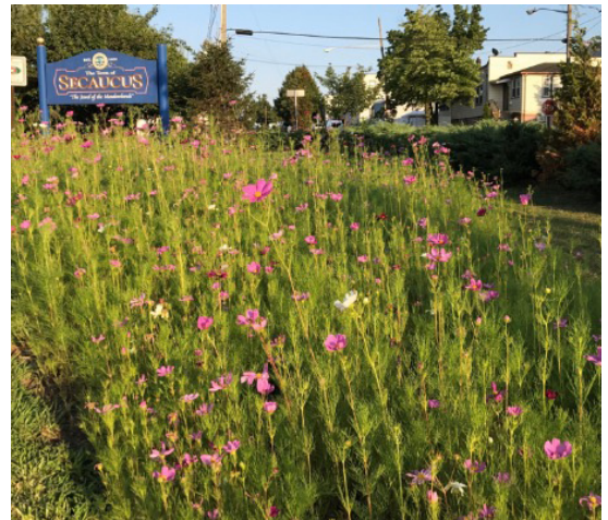
Wildflowers on the Rt. 3 island planted by Secaucus DPW and members of Integrity House