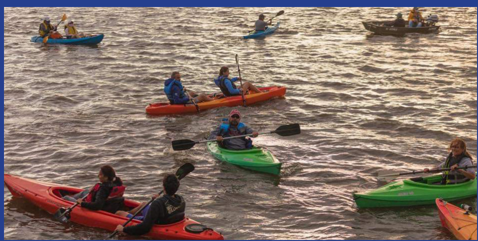
the river where the hospital's staff also gathered. Hudson Regional Hospital has been pivotal in the fight against COVID-19 and was selected as Hudson County's official testing site in March. The June 1, 2020 event was unique and was appreciated by all at Hudson Regional Hospital.

As the hues of the sky blazed with colors of the setting sun, residents in kayaks joined the Fire Department's Marine 1 fireboat in the Hackensack River to applaud healthcare workers and staff of Hudson Regional Hospital. They termed it "Nautical Clap Out", a novel way to continue the daily 7:00 pm clap out to appreciate healthcare workers for their vital role in fighting COVID-19. Numerous residents on foot joined in, standing on the banks of