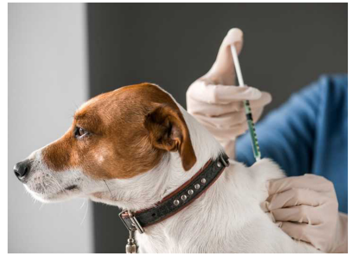
Alternate Side Parking In Effect March 14

Please note, the pet must be registered with the Town prior to receiving a voucher. To obtain a rabies vaccine voucher, please contact the Health Department at 201-330-2031.