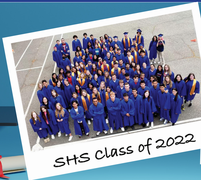
SHS Class of 2022