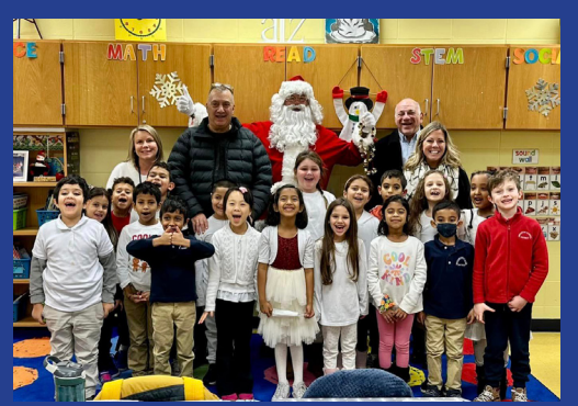
Santa visited some Bears at Huber Street during the month of December!