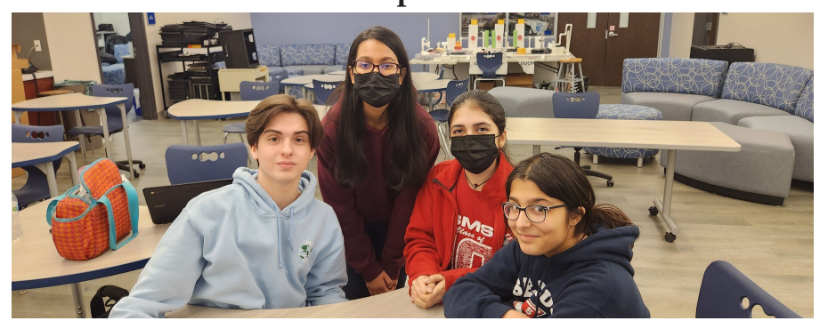
Secaucus High School S.A.I.L. students held their monthly virtual Senior Citizen Computer tutoring class.