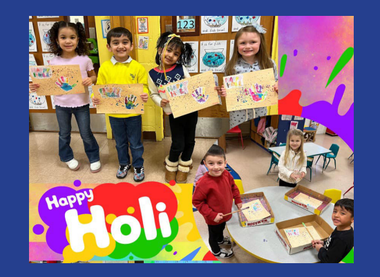
Students from around the district celebrate "Holi", a Hindu holiday celebrated as the Festival of Colours, Love and Spring!