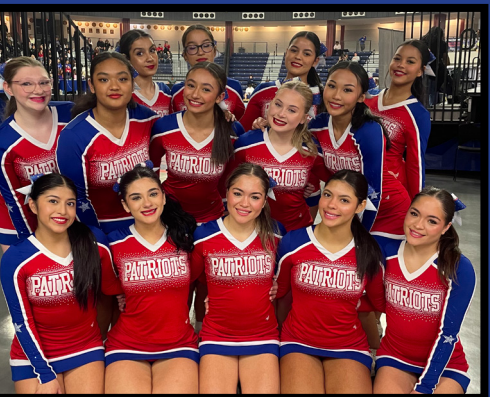
2024 got off to a great start for our cheer teams. Both the Secaucus High School Varsity team and the Recreation Cheer team won first place in their respective categories. Way to go!